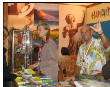
HTE's booth at ITB.

in a Media Café attracting 170 journalists, who discussed topics and story ideas on the Islands at length. HTE also invited 10 key trade and media partners from the market to an exclusive dinner. Hawai'i was represented at ITB by Hawai'i Tourism Authority, Maui Visitors Bureau, Kaua'i Visitors Bureau, Destination Resorts Hawai'i, and Sun Islands Hawai'i.