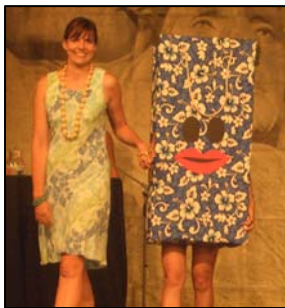
"Aloha Shopping Bag" walking down the runway.

HTO and Hawaiian Airlines recently participated at the See Americas Expos in Perth, Sydney, Melbourne, Brisbane, Australia and Auckland, New Zealand. The theme was shopping and the event was a great success with many agents visiting the stand.