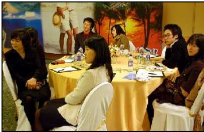
HTK held a honeymoon event at JW Marriott Seoul for 100 couples.

approximately 100 couples received an in-depth presentation on Hawai'i. HTK displayed Hawai'i image banners in the event hall and provided giveaways for those who booked Hawai'i honeymoons on the spot. HTK also provided guidebooks and giveaways to agents participating in the KINTEX wedding fair.