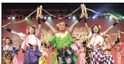
Performers at HCC.

On March 9-11, more than 5,000 artisans, performers and spectators from Japan, Australia, Taiwan, and the Philippines were in town to participate in the 13 th Annual Honolulu Festival. This year's theme was " Pacific Renaissance ," and locals and visitors enjoyed art, music and dance performances at the Hawai'i Convention Center, Ala Moana Center and