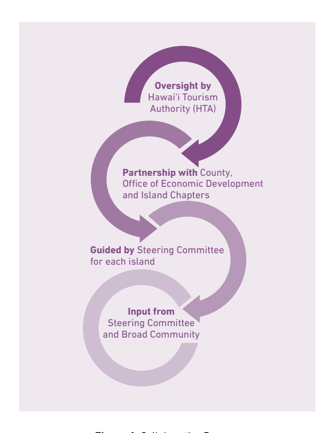
Figure 1 Collaborative Process

At the first Steering Committee virtual meeting, the members reviewed HTA's Strategic Plan in addition to the 2019–2021 Kaua'i Tourism Strategic Plan, including HTA's key performance indicators and four pillars, as well as the county's tourism strategies and situational analysis. These two plans are the foundation