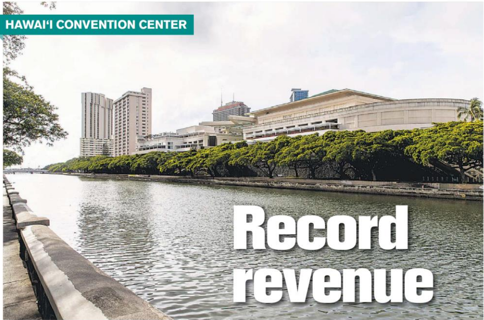
Honolulu Star Advertiser, Jan 8, 2024