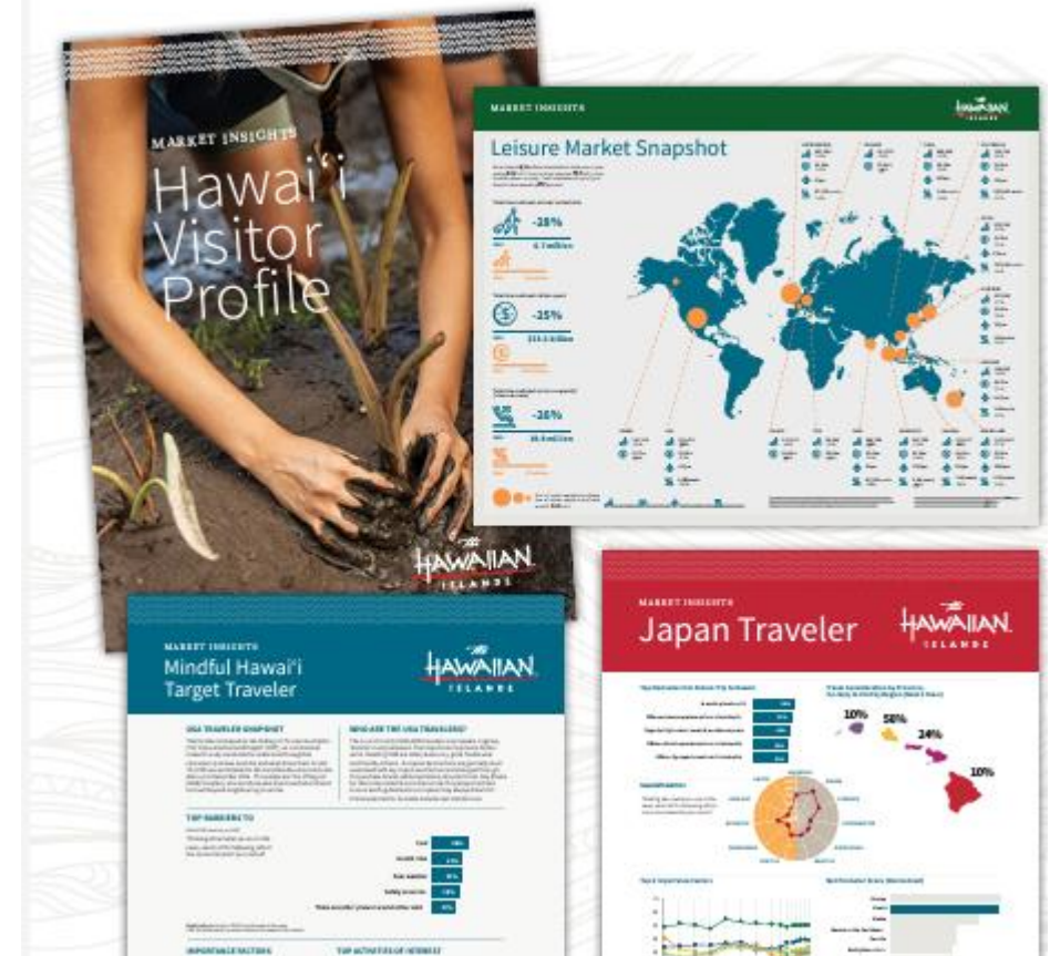
Example mockups of Tourism Insight reports and snapshots: